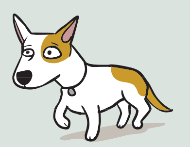
Moving in Slow Motion walking slow on floor