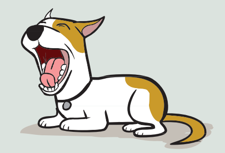
Acting Sleepy or Yawning when they shouldn't be tired