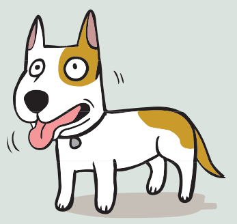
Panting when not hot or thirsty