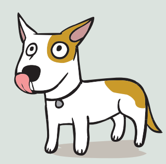
Licking Lips when no food nearby